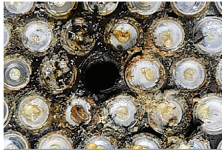
▲ Breakdown photos: not representative of trade secret test set up