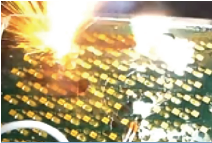
▲ In test photo: circuit board in test